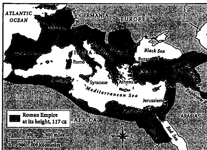
The Roman Empire at its height

Your task is to examine the documents in this Mini-Q and decide which three problems were most responsible for bringing Rome to its knees. Then, of these three problems, decide which was most important.